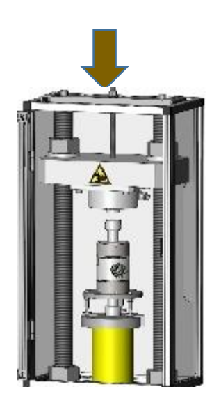
HOEK cell with strain gauges