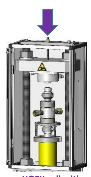
HOEK cell with acoustic velocity fixture