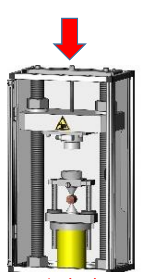
Point load fixture