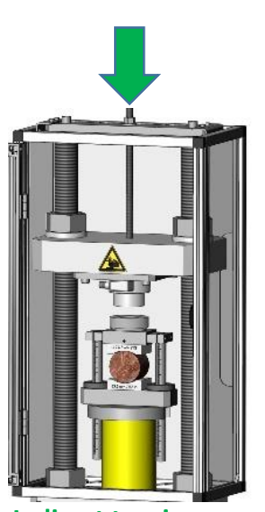
Indirect tension Brazilian fixture